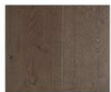
OT10161 Oak Twilight 1860x189x15mm