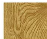
KS8131 Oak Landgrave 1860x189x15mm