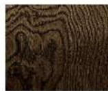
OT10060 Coffee Oak 1860x189x15mm