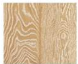
KG6113 Sand Oak 1860x189x15mm