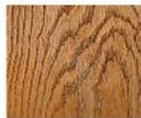
KG6116 Rustic Oak 1860x189x15mm