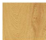
KS8102 Oak Prague 1860x189x15mm