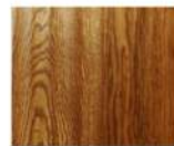
KG5171 Oak Greece 1800x148x15mm