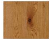
OT10160 Oak Yellowstone 1860x189x15mm