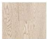
KG6110 Snowy Oak 910x125x15mm

The luxurious wide hardwood, all of the unique features that can only be found in real wood are emphasized, such as knots and variations in colour and grain, to create a natural feeling and bring the luxury into your room as well.