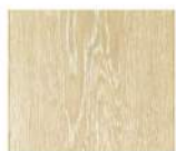
KS8169 Aurora Oak 1860x189x15mm